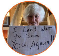
Tennyson staff members utilizing telehealth technology and a Tennyson supporter sending our children words of encouragement.