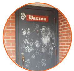
The front door of Warren cottage.

“I am going to talk a little bit about the Warren cottage. I have been in there for over one year. We have had a lot of staff stay and go and same with the clients. Certain aspects remain the same, but some are different from other areas. Some things that are the same are that we do room transitions after every activity. The reason we do this is so we can get our mind and head back in a space where we can be appropriate with the group. Some things that we do that are different are we do a lot more peer play with our peers during movies. The staff are supportive of us and what we are dealing with in our lives. The staff that work in there now are Mr. Keith, Ms. Emily, Ms. Max, and Mr. Nathan. We also go off campus a lot so we can learn how to be regular people in our society.”