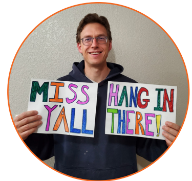
Encouraging words from a Tennyson supporter.

and support the kids and families is amazing.”