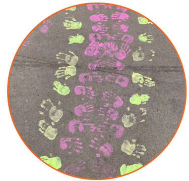
Art from the campus kids' "Chalk Walk" in April.

relationships with others. Tennyson is my very first job out of graduate school and although this pandemic has thrown us all off, I have intense gratitude for the opportunity to finally be doing what I’ve dreamed of doing for so long.”