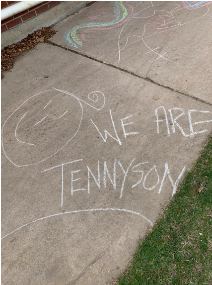
"WE ARE TENNYSON" words from campus kiddos during their April "Chalk Walk" created to inspire and support one another.

2950 Tennyson Street Denver, CO 80212-3029