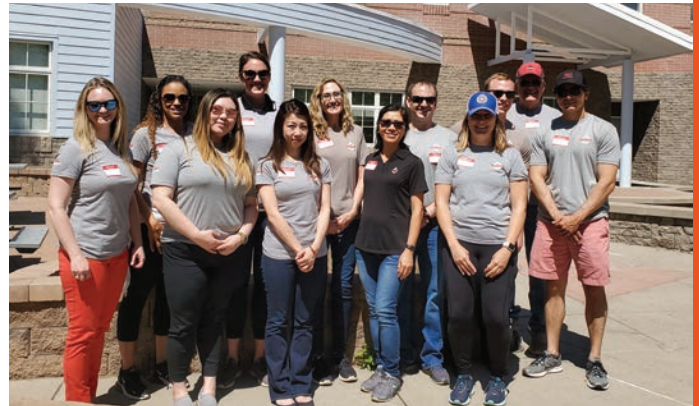
Our friends from Whiting Petroleum helping on campus.