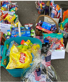
Students at Regis High School came together to donate fun activity baskets for Tennyson kids and families on our campus and in our Community Based Programs. Thank you, Regis!